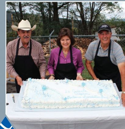
Enjoy food, live Mariachi music and more!