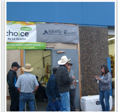
▲ Tasty food and beverages were served by La Jicarita staff and board members

La Jicarita's second annual Customer Appreciation Day on August 17th was enjoyed by more than 120 guests who enjoyed live music, delicious food and friendly conversation.