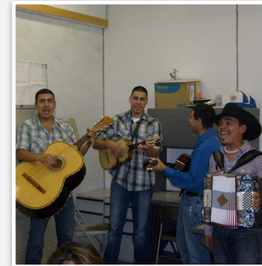
▲ Mariachi music entertained guests at the 2nd annual event