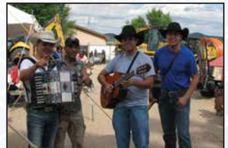
El Trio Los Gallos

The La Jicarita staff, management and board of directors would like to thank all of our members for being part of the cooperative's continued success.