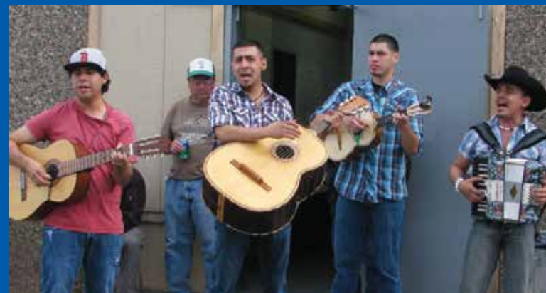
Enjoy El Trio Los Gallos at this year's event

You're invited to our 5th annual Customer Appreciation Day Friday, June 26th. This year we will celebrate our 50th Golden Anniversary with fajitas, a jumping tent and music from El Trio Los Gallos, back by popular demand. Drop in and celebrate at our office 455 State Hwy. 518 in Mora.